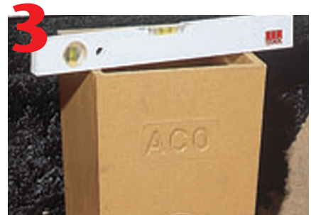
3 Position PointDrain on a 4" thick concrete slurry bed and ensure it is level.