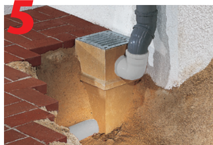
5 Add riser (if required) and connect inlet pipe (if required). Surround PointDrain with good quality concrete. Finish with surfacing material.