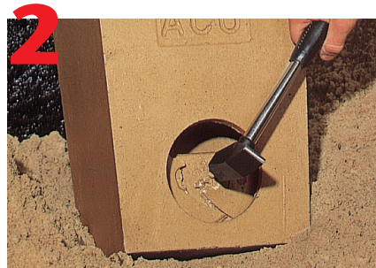
2 Drill out/cutout holes for pipe connection.