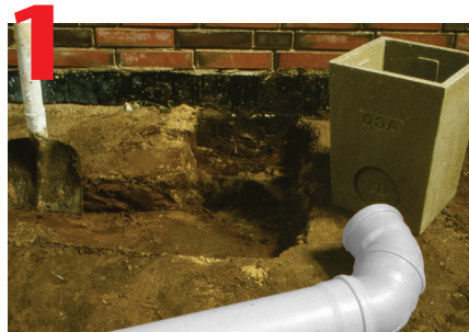
1 Dig hole to fit PointDrain and necessary pipe-work.