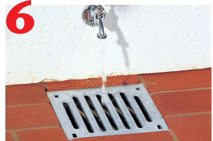
6 Ensure finished surface is 1/8" higher than the grate to assist water drainage.