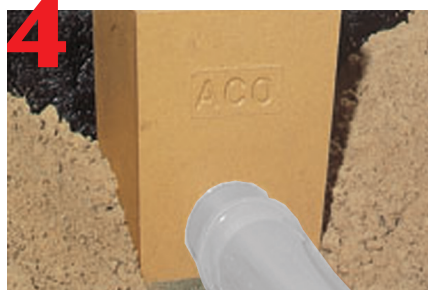
4 Connect drainage pipe, check for leaks before backfilling.